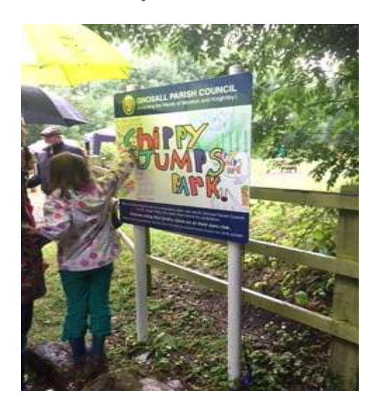
The opening of the Chippy Jumps Park, June 2017, a project funded with S106 money