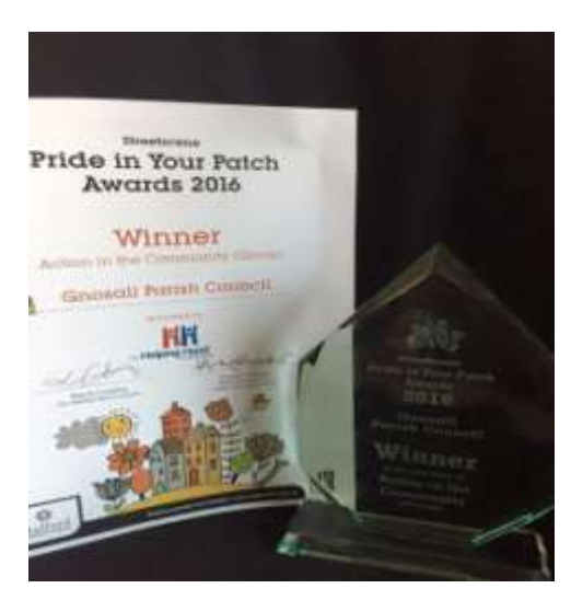
Gnosall Parish Council's Pride in Your Patch Award 2016